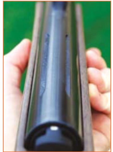
The Super Grade's receiver is grooved to take a scope (above), and has an automatic, resettable safety catch (below) at the end.

Some ammo was hard to press into the breech with my thumb, but .177 SMK Air Gun pellets went in fine. Apparently, a tight breech helps the rifle's accuracy,